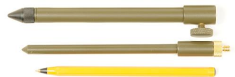
E1a Single Ground Spike

Maintenance Some light oil or WD40 on the screw threads to keep the spike in good condition