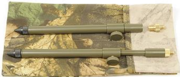
E11 Camera adaptor In solid brass

The E1 and E2 can be joined together to make a taller spike or added to the E5 Ground Spikes