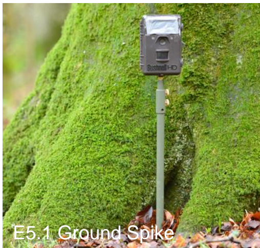
E5.1 Ground Spike

Our E1a, E1 and E2 Ground Spikes are ideal for low level trail cameras, flashes, triggers etc. With an extra camera adaptor code E11 they can be turned into two separate ground spikes