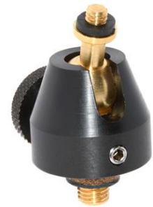
E14 Ball head