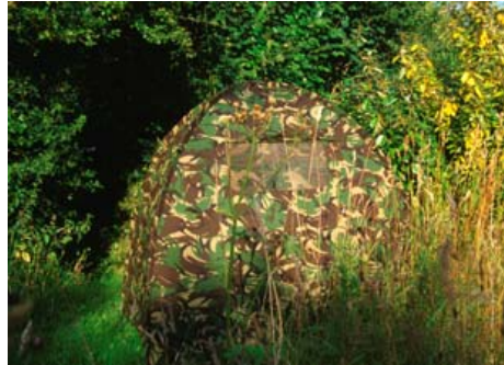
C30.1-C Dome hide

When I use the Throw over hide (Bag Hide), usually the C33L-G lightweight in Hardwoods Green , it's more opportunistic. I'm normally out walking in the forest or across the moors. If I can see some deer in the distance, I can get in a position (depending on wind direction). If it all goes to plan, the deer come past me and I can get a shot. The positive side of using the Throw over hide (Bag Hide) is that it's compact and lightweight. You can put it around your camera kit in a bag or rucksack and you are more likely to take it out with you compared to a Dome Hide, which I only take out when I'm going to a specific location.